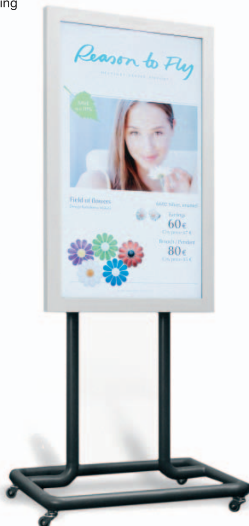
This specification is subject to change without prior notice.