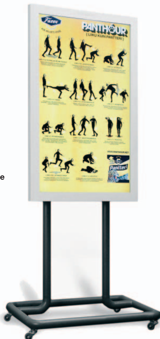
This specification is subject to change without prior notice.